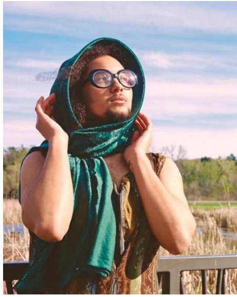
Mason Persons Name as pronoun