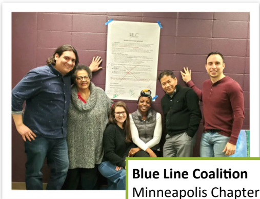
Blue Line Coalition Minneapolis Chapter

Each year MICAH celebrates the individuals and organizations who work toward ending homelessness within our mission to create and sustain a metropolitan area where everyone without exception has a safe, decent, accessible, and affordable home.