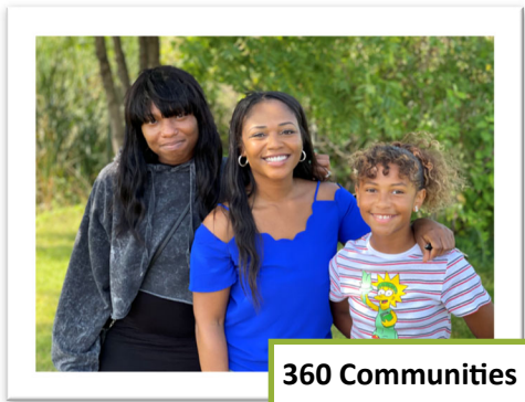
360 Communities South Chapter - Dakota County